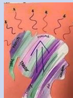
Student Art Project

Based on the positive feedback about Camp AP from both staff and students, El Camino is already discussing ways to reach out to more AP teachers and students for next summer. They hope to double attendance each year until all AP students have the opportunity to attend such a fun and beneficial summer program.